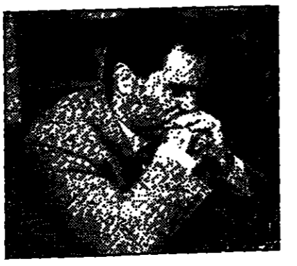
Did Garry Kasparov give up too easily?